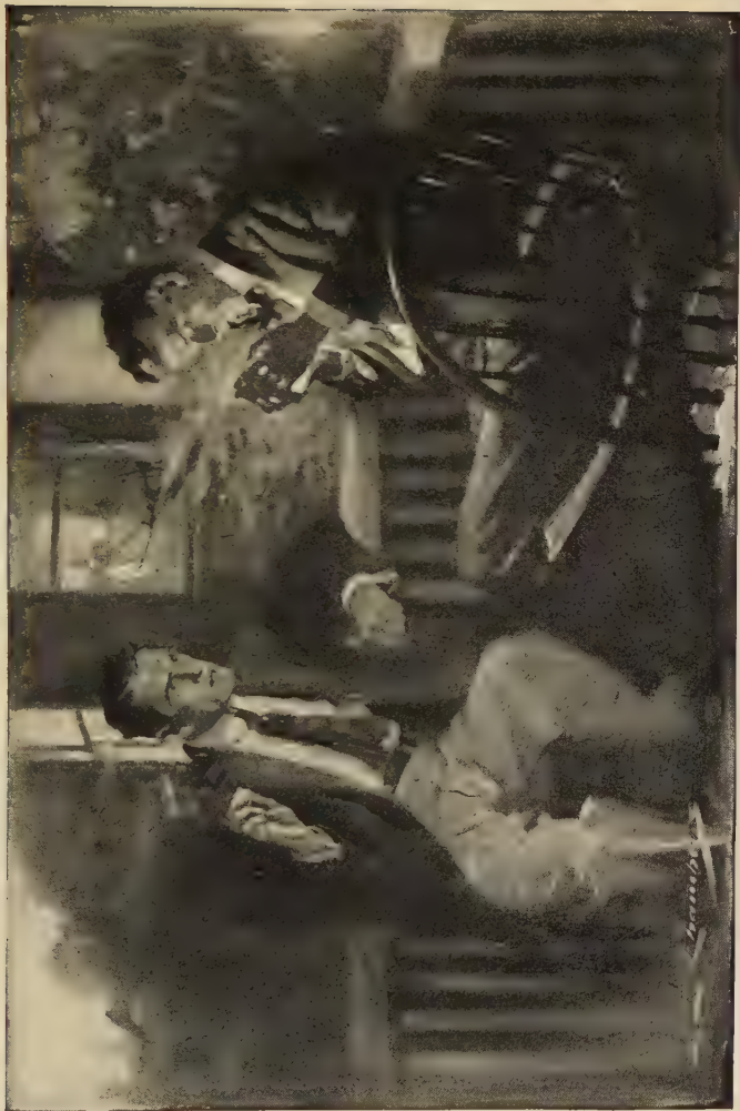
HIS QUIET PROFILE GLOWED AGAINST THE NIGHT